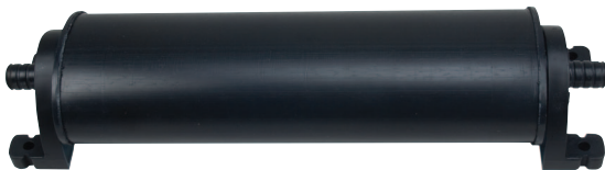
Without Heat Shield

Hose clamps must used in accordance with ABYC Fuel System Vent Hose Clamping Standards (H24 Table 3). The clamp must not distort the fitting on the canister when tightened.