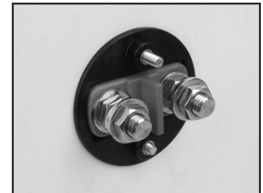
Back View Installed