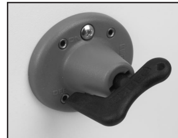
Front View Installed