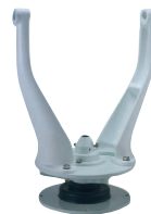
Fig. 9508000 15" Yoke Assy

A unique design feature of the 1600 Watt XR Series Searchlight is the ease with which the optical assembly can be changed. By removing a few bolts and easily accessible wires, the entire assembly comes out the front of the searchlight as one complete unit. Even older lights can be upgraded to current technology with just a simple swap out of optical assemblies and power supplies.