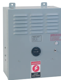
Fig. 9511 500 Watt Power Supply

XR Series power supplies are made using high quality, durable components. Power supply units can be easily exchanged for factory rebuilt units offering a low cost means of repairing or upgrading older units in the field. All power supplies include a remote panel for controlling lamp ignition and focus.