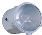
Fig. 9504000 15" Head Assy