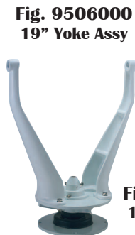
Fig. 9506000 19" Yoke Assy