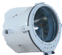
Fig. 9501000 19" Head Assy