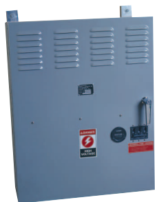
Figs. 9512000 & 9514000 1600 Watt Power Supplies