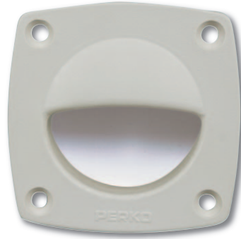
Fig. 1016 Ivory