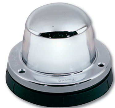
Fig. 0964 Masthead