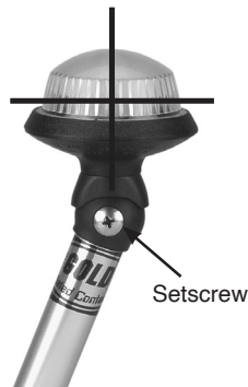
Note: Clear Globes Must Be Vertical During Operation.